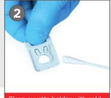
water or mild detergent, followed by disinfectant