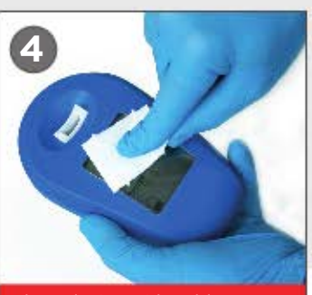
Clean device with cold water or mild detergent, followed by disinfectant