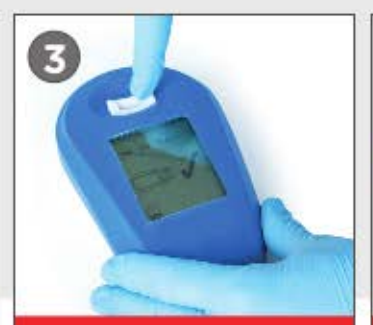
Reinsert the dry cuvette holder by pressing down until you feel a "click"