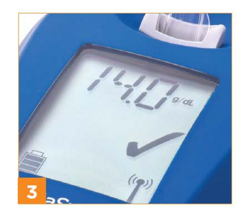
Results appear in just about 1 second